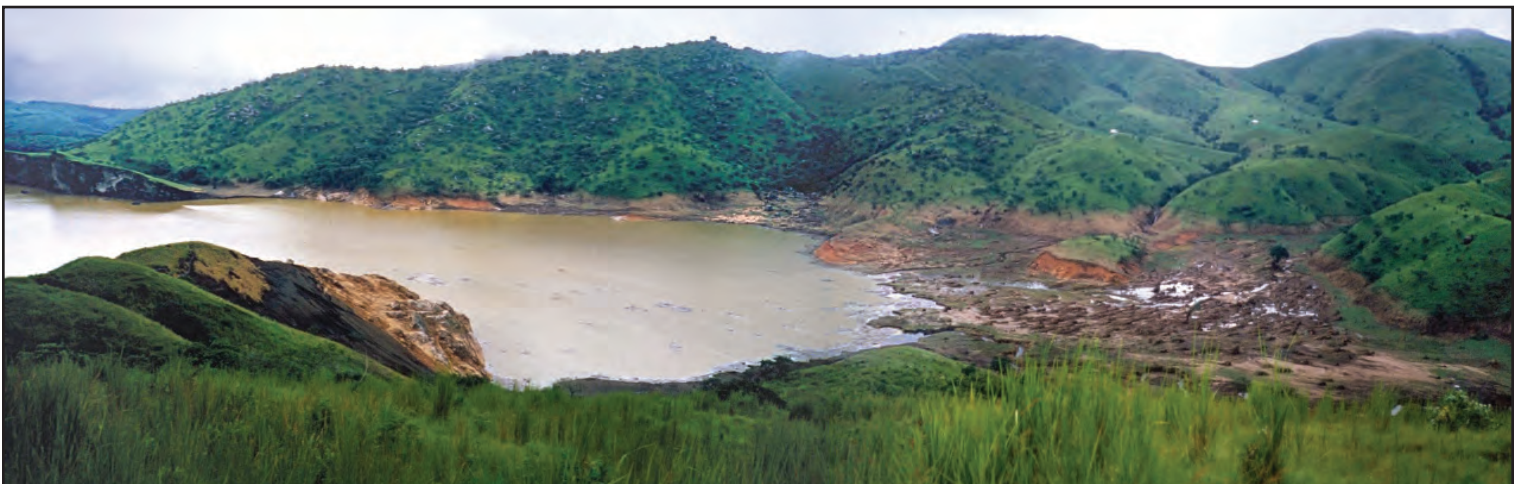
Cameroon's Lake Nyos, approximately two weeks after releasing a large eruption of CO 2 , creating a cloud that killed 1,746 people and displacing 4,430 more.

To ensure climate safety, polluters must guarantee that carbon can be stored for thousands of years, but long-term stable storage of CO 2 remains largely unproven. 148 Existing storage projects have not been able to prove that CCS actually works because underground CO 2 imaging technology is nascent. 149 Despite this, pro-CCS state legislators are moving bills that would shift the financial liability of long-term storage onto the public. 150 Storage optimists cite efforts to control methane leakage as purported proof that CO 2 leakage is fixable, despite ongoing substantial methane emissions from natural gas production. 151