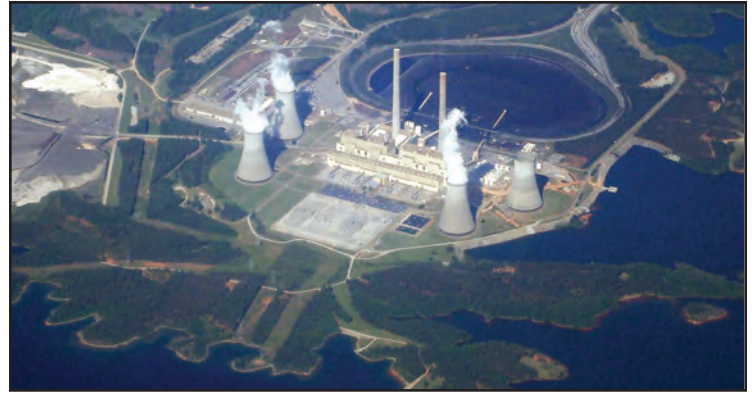
Georgia Power's Plant Scherer is one of the largest coal-fired thermoelectric power-production facilities in the United States.

Power plants release air pollutants like mercury, particulate matter, sulfur dioxide (SO 2 ) and nitrogen oxides (NO x ). 45 Their SO 2 , NO x and particulate matter pollution contributes to respiratory health problems (such as chronic bronchitis, asthma, emphysema and existing heart disease), causes labored breathing and reduces life expectancy. 46 Particulate matter pollution from power plants is responsible for 15,000 premature deaths annually. 47