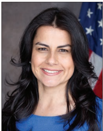
Rep. Nanette Barragán (CA-44)