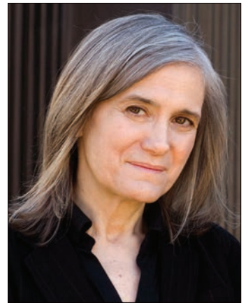
Amy Goodman 2021 Food & Water Watch Honoree