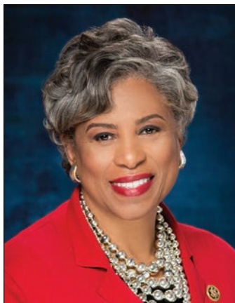
Rep. Brenda Lawrence (MI-14)