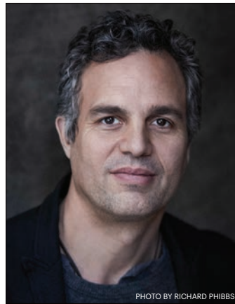
Mark Ruffalo Actor and anti-fracking activist