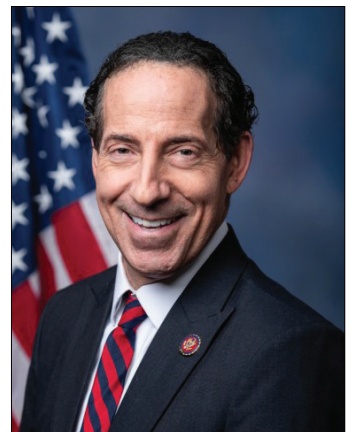
Rep. Jamie Raskin (MD-12)