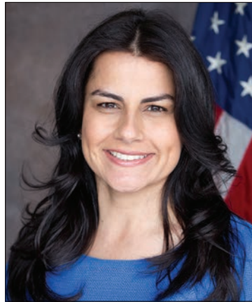
Rep. Nanette Barragán (CA-44)