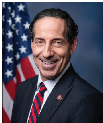
Rep. Jamie Raskin (MD-12)

The program is current as of September 14, 2021.