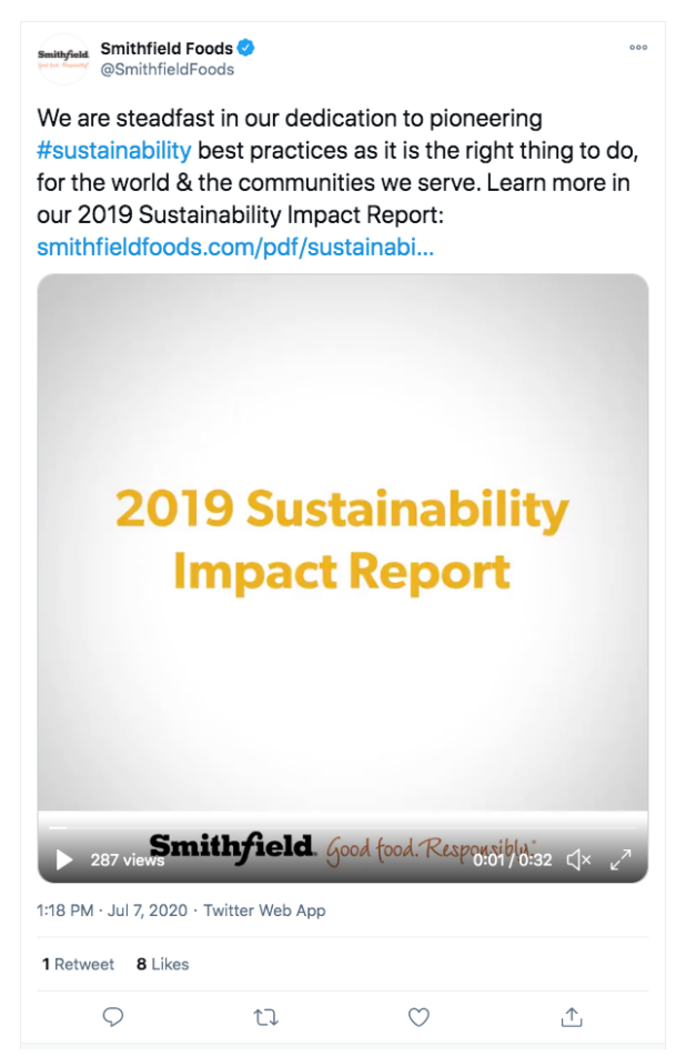
Figure 3. A Smithfield Foods Twitter post about its "pioneering #sustainability best practices."<sup>41</sup>

Smithfield's interactive "sustainability" website features illustrations designed to appeal to