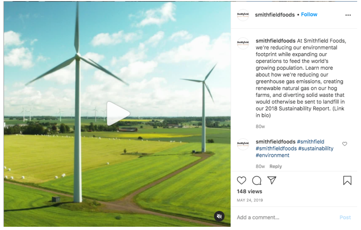
Figure 2. Instagram post touting its supposed commitment to the environment with images of wind farms and hashtags including "#sustainability" and "#environment." <sup>40</sup>

Smithfield's campaign of environmental advertising and marketing is not limited to YouTube and Facebook. It also utilizes other social media, such as Twitter, to communicate with consumers about its supposedly "industry leading sustainability" practices.<sup>38</sup> It amplifies these messages by marketing across platforms, reposting its sustainability claims on Facebook, Twitter, and Instagram.<sup>39</sup>