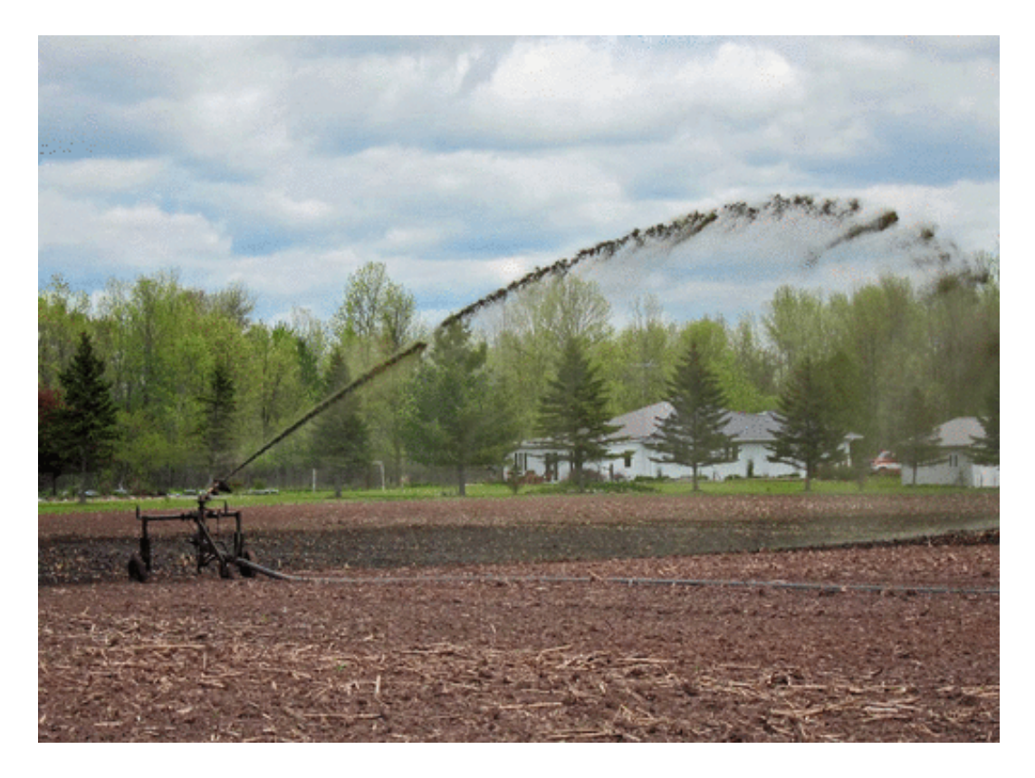
Figure 10. An example of a typical spray gun used to dispose of factory farm waste on fields, <sup>99</sup> other methods of spray application are also common.

Smithfield's irresponsible waste generation and management cause further problems in addition to severe environmental impacts. They also negatively impact quality of life and threaten the health of communities living nearby, disproportionately affecting low-income and minority communities.<sup>100</sup> The realities on the ground belie Smithfield's representations that it is "committed to protecting the environment on and around our hog farms through pollution prevention"<sup>101</sup> or that it is a "responsible steward[] of water supplies and partner[] with our communities."<sup>102</sup> For