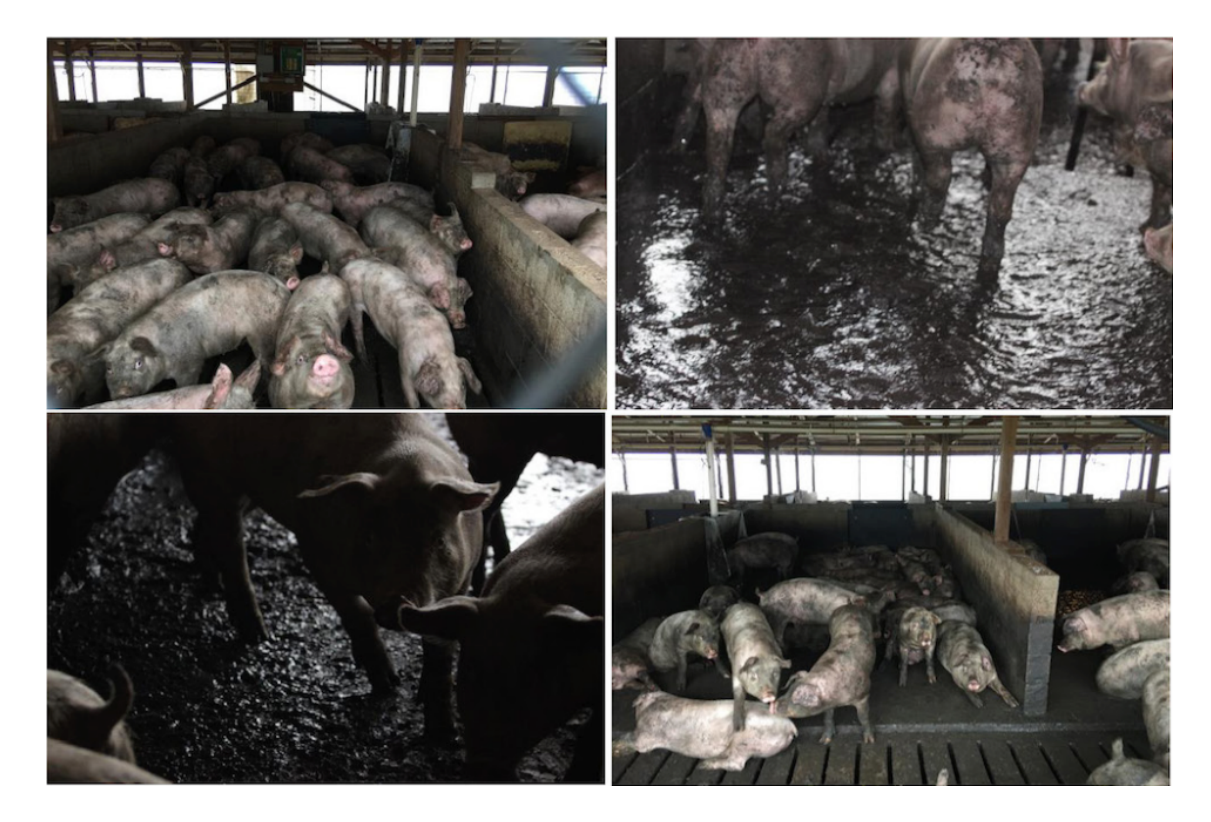
Figure 6. Images from then-Smithfield contract farm, Kinlaw Farms, North Carolina.<sup>71</sup>

business ventures in Utah, where it has built massive complexes of factory farms to confine hundreds of thousands of pig in order to capitalize on extracting biogas from their manure.<sup>70</sup>