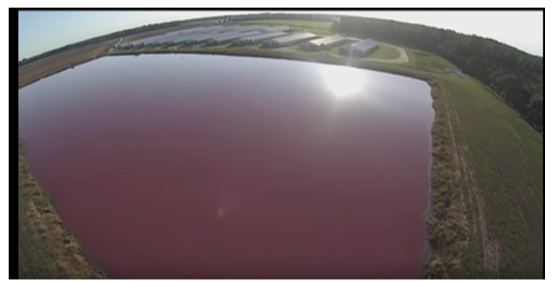
Figure 8. A lagoon full of pig excrement the size of multiple football fields at a Smithfield facility. <sup>94</sup>