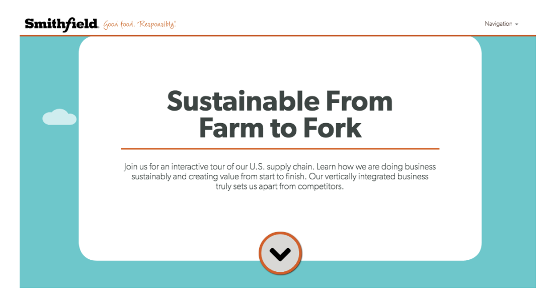
Figure 1. A Smithfield sustainability claim found on its company website, clearly telling consumers that it is "doing business sustainably … from start to finish." <sup>26</sup>

"guarantee[s] the highest environmental standards in the Smithfield production process."<sup>24</sup> "We are Stewards of the Environment," Smithfield tells consumers while touting its scheme to install biogas-producing digesters at some of its facilities to monetize its harmful and polluting waste streams.<sup>25</sup>