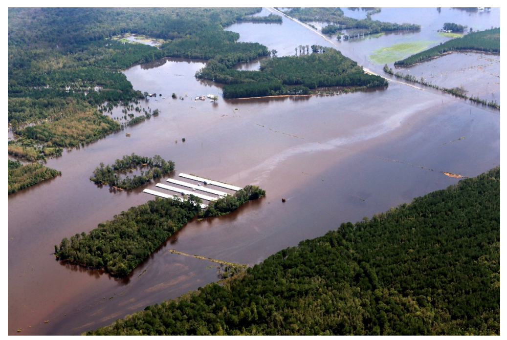
Figure 9. A North Carolina manure lagoon overflowing in Hurricane Florence's aftermath.<sup>95</sup>

<sup>94</sup> SpeciesismTheMovie, Spy Drones Expose Smithfield Foods Factory Farms , YouTube (Dec. 17, 2014), <a href="https://www.youtube.com/watch?v=ayGJ1YSfDXs">https://www.youtube.com/watch?v=ayGJ1YSfDXs</a> (last visited Jan. 27, 2021). <sup>95</sup> Rick Dove, _67P0087, Flickr (Sept. 17, 2018),