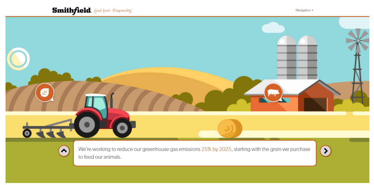
Figure 4. Smithfield's interactive website that shows bucolic farms with no apparent pollution and makes environmental claims. <sup>52</sup>