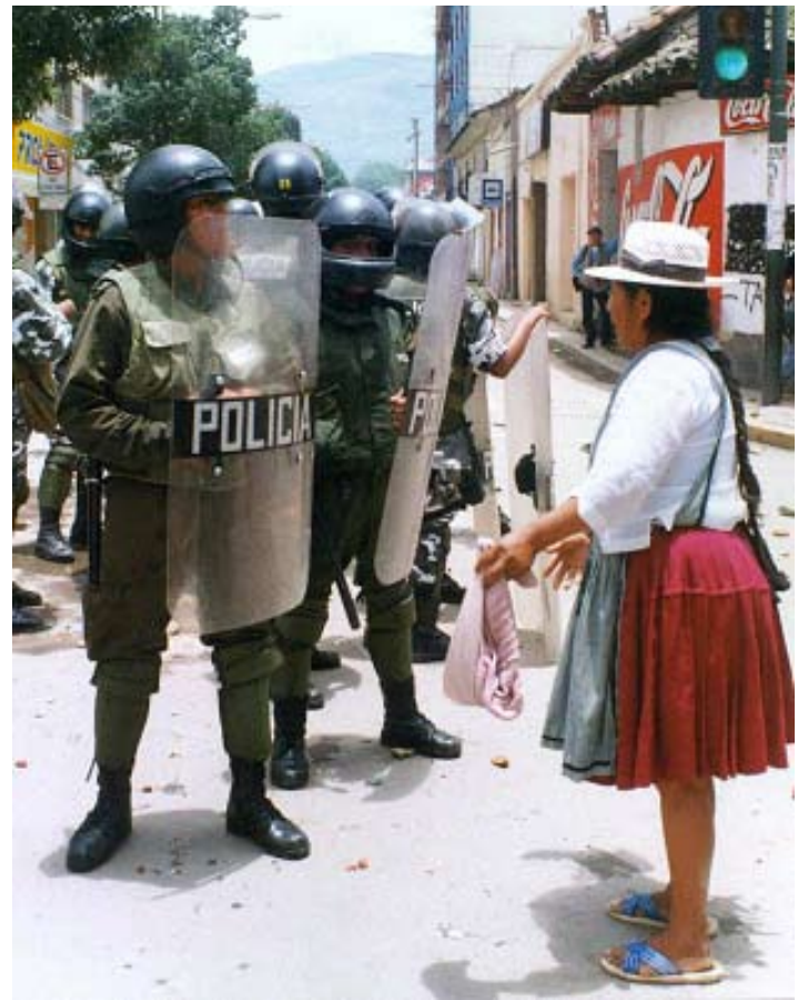
A woman protests Bechtel’s privatization of water in Cochabamba, Bolivia. The case ultimately ended up in ICSID arbitration.

Bank’s investment court. For more background, read Food & Water Watch’s new report, Challenging Corporate Investor Rule , at www.foodandwaterwatch.org/water/pubs/reports/corporate-investor-rule