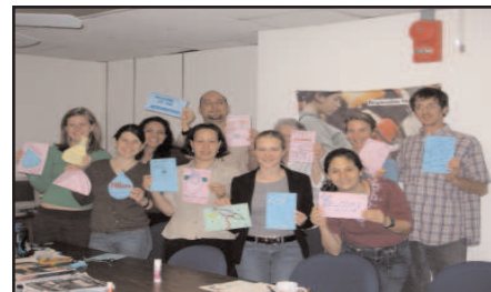
TOP: Water activists display homemade greeting cards for the new CEO of American Water, Donald Correll, asking him to respect the wishes of communities who want local control of their water!

Thanks to concerned citizens like you, nearly 1,000 members on our Water for All list have taken action against the Bush administration's attempt to undermine U.S. water quality. If you have not already taken action please go to http://www.foodandwaterwatch.org/water/alert-your-drinking-water-is-at-risk-and-so-s-your-health . Numerous environmental, utility, consumer and health-based groups have made their protest heard. If the administration ignores our voices, the proposed change may result in increased cancer and other disease-causing chemical contaminants in the drinking water for millions of Americans. Such a change does not only impact our drinking water quality standards, but could have wide ranging impacts on our ability to protect the environment. Make your voice heard today!